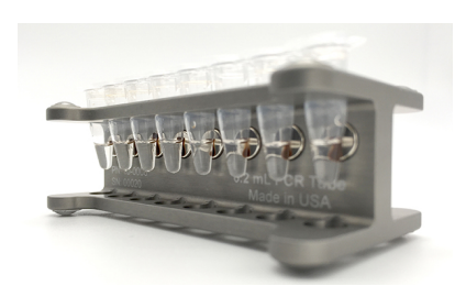
Figure 3 . For processing individual samples, it is recommended to use multi-channel pipetting using 8-strip PCR tubes and compatible magnetic rack ( e.g. EpiCypher 10-0008, pictured), increasing experimental throughput and reproducibility.