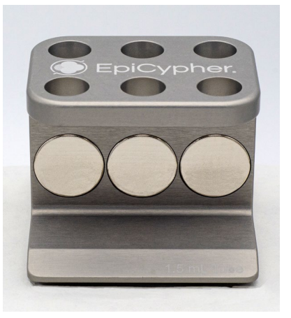
Figure 2. For ConA bead activation steps, it is recommended to batch process the full volume of beads needed for all experimental samples in a single 1.5 mL tube (11 \mu L beads per sample). For these steps, beads can be washed using a 1.5 mL magnetic rack ( e.g. EpiCypher 10-0012, pictured), ensuring homogeneity across samples.