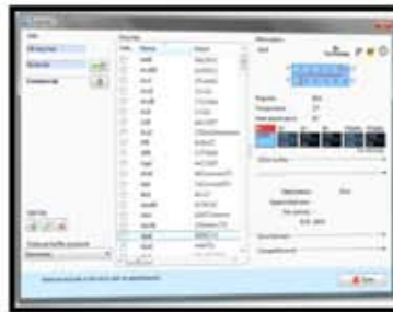
Enzyme database includes buffers, temps, methylation and more.