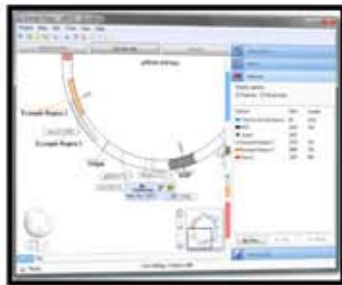
Simple navigation and linear maps provide detailed views of your sequence.

QuickGene's comprehensive enzyme database, detailed reaction conditions and free monthly updates ensure the highest attention to detail for your DNA analysis, assembly or cloning!