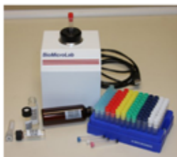
SampleScan Plus Single Tube Reader