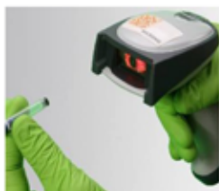
Hand Held Wireless Scanner

Now You Can Organize, Store, Edit, Search For, and Share Your Sample Data For Free With the Purchase of Any Micronic 2D Barcode Reader!